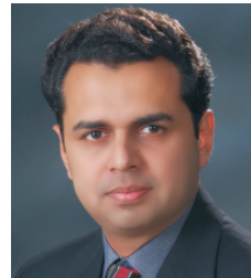
Mr. Muhammad Tallal Chaudry, MNA NA-76, Faisalabad-II, Punjab, PLM(N)

Mr Murad Saeed holds a B.Sc Hons degree in Environmental Sciences from University of Peshawar. It is his first tenure as Member National Assembly.