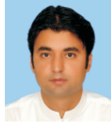
Mr. Murad Saeed, MNA NA-29, Swat-I, KP, PTI

He is an MBBS Doctor from Khyber Medical College, Peshawar. Health & Medical Sciences are his area of expertise. He is a Social Worker & Philanthropist who has worked all life for the welfare of people in the province of Khyber Pukhtunkhwa especially in Hazara Division. Social Work and establishing institutions in his constituent division has been the hallmark of his career. He holds the position of Central President of Pakistan Medical Association since 2011. He is also serving as Managing Director of Women Medical & Dental College Abbottabad, President of SAWERA Welfare Organization, President of Professional Education Promotion Society (PEPS) and President of Abasin Arts Council Hazara. He had contested the General Elections of 2001 & 2008 as well. He has made several foreign visits including those to England, Srilanka, Afghanistan, Egypt & UAE. He is currently serving as member of two of National Assembly's Standing Committees, namely Information, Broadcasting & National Heritage and National Health Services Regulation & Coordination.