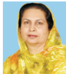
Mrs. Belum Hasnain, MNA RS-Women, Punjab, PPPP

At present she is an Honourable Member of the National Assembly of Pakistan, Parliamentary Secretary for Ministry of Interior & Narcotics Control, Convener of Parliamentary Task Force on SDGs and also working as a special aide to Hon' Speaker on Parliamentary Strengthening.