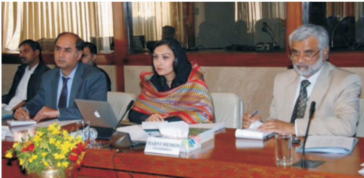
Ms. Marvi Memon, Chairperson Standing Committee on Information Broadcasting and National Heritage Chairing the Committee meeting at Parliament House on 13-03-2014

It was reiterated during the meeting that the importance of National Language was imperative in National Harmony. Committee members agreed that Language is the main source of communication, so it is also the best means to bring divergent people together. Developed countries have declared their major mother tongues as national languages. This has helped reduce differences between different types of people living in one country. The committee was informed that National Languages were generally multiple in numbers as can be observed globally. A few amongst the many countries having multiple National Languages were, China (9), India (22), Belgium (3), Namibia (11), Singapore (4), South Africa (13), Spain (5) and Switzerland (4). This has been a major contributor